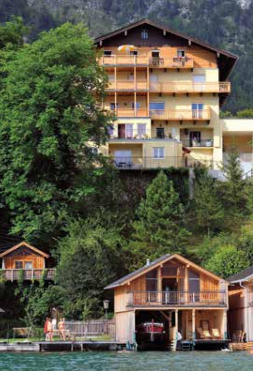
Residence by the lake