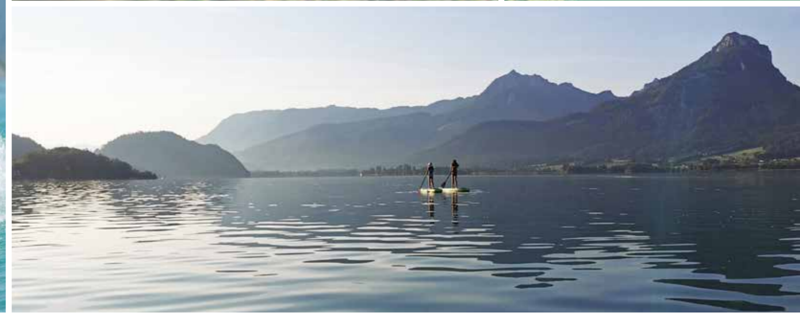
Spring & Summer