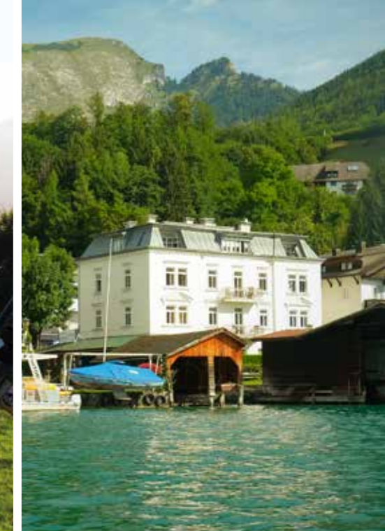
Residence by the lake